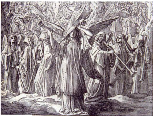
OPENING OF THE SEVENTH SEAL. Rev. viii. 1-6.

The Seventh seal, brings the 7-angels who have the trumpets judgments forward.