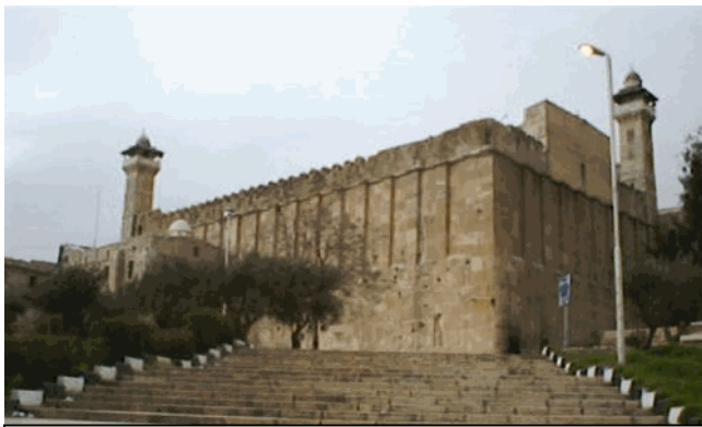
Machpelah, building houses Tombs of the Patriarchs and Matriarchs

1 When Abram was ninety-nine years old, the LORD appeared to Abram and said to him, "I am Almighty God; walk before Me and be blameless. 2 And I will make My covenant between Me and you , and will multiply you exceedingly." 3 Then Abram fell on his face, and God talked with him, saying: 4 "As for Me, behold, My covenant is with you, and you shall be a father of many nations. 5 No longer shall your name be called Abram, but your name shall be Abraham; for I have made you a father of many nations. 6 I will make you exceedingly fruitful; and I will make nations of you, and kings shall come from you. 7 And I will establish My covenant between Me and you and your descendants after you in their generations, for an everlasting covenant, to be God to you and your descendants after you. 8 Also I give to you and your descendants after you the land in which you are a stranger, all the land of Canaan, as an everlasting possession; and I will be their God. "