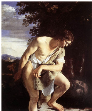
2 Samuel 7:10-16

The Davidic covenant was established when the prophet Nathan delivered to David a message from God after David was forbidden to build the Temple.