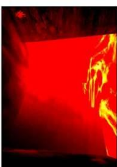
Lake of Fire

The Antichrist and False prophets are the first two occupants of the Lake of Fire, the eventual place of judgment for those in Hell.