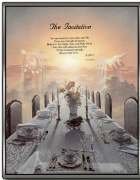
The Invitation © 1999 Danny Halbohm All rights reserved by the artist