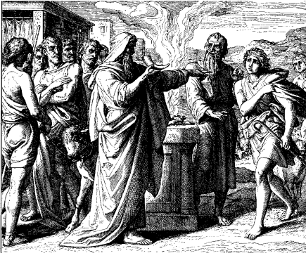
The Messiah will be a Son of David

12 “When your days are fulfilled and you rest with your fathers, I will set up your seed after you, who will come from your body, and I will establish his kingdom. 13 He shall build a house for My name, and I will establish the throne of his kingdom