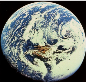
Messiah will rule the Earth as Son of Man

As we can see Jesus, use of the term “Son of Man” was not metaphorical in the slightest but was “Messianic” and demonstrative of whom He claimed to be. Many of the attributes of the Son of Man are reserved for God Himself in the writings of the Old Testament.