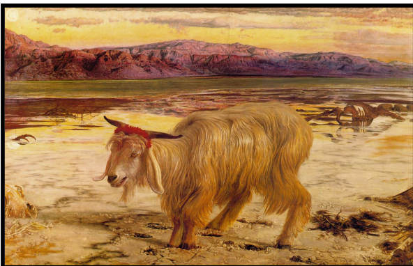
Figure 4, The Scapegoat bore the sins of Israel in the wilderness