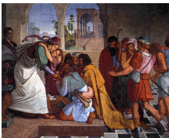
Figure 5, Joseph reunited with his brothers

Objection: If Jesus was Messiah, the Jewish people would have never rejected him!