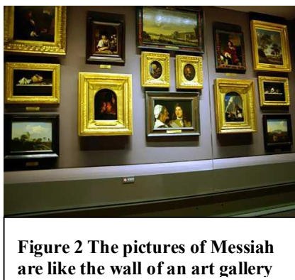
Figure 2 The pictures of Messiah are like the wall of an art gallery

Through the revelation of scripture, God painted a picture of Messiah for the nation. Sometimes these pictures clearly state Messiah 1 in the text, other times, there are clues within the context of the scripture, allowing us to know Messiah is referent. For example, “ Son of David ” is clearly a