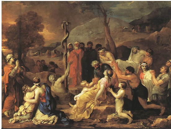
Figure 3, Brazen Serpent in the wilderness