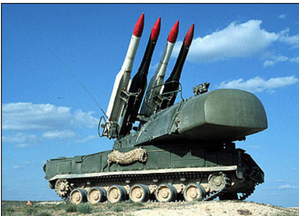
Tor M1 missiles supplied to Iran by Russia to protect them from an Israeli or US strike against their nuclear as the land Russia, will ally itself with Muslim nations, to oppose Israel in the last days.

The miracle of the nation of Israel, cannot be under estimated. Ezekiel, 2600-years ago, along with the other prophets of the Bible, foretold of a national rebirth of Israel, gathered from the nations (Ezekiel 36-37). Ezekiel followed this by describing a confederation of nations who would attack a reborn, nation assembled out of the nations in Ezekiel 38 and 39. This event, known in the Bible as the battle of Gog and Magog is a war in the last days.