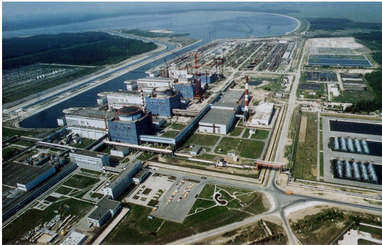
The Bushehr nuclear built for Iran by Russia

What role does Islam play in the world? And what is the final outcome of Islam? These questions continue to come to mind to those who see the conflict between Islam and the West rise. One cannot help but see the series of conflicts all around the world, and see the role Islam plays.