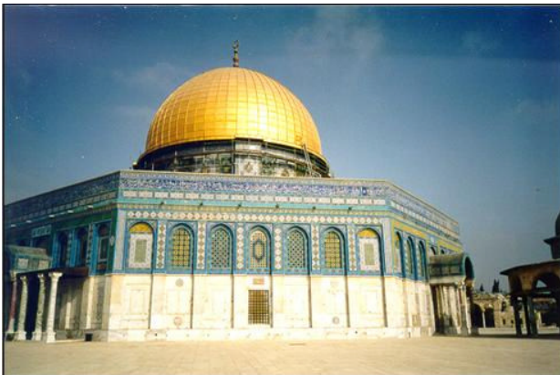
The Dome of the Rock, Location of the Jewish Temple

The third most holy place for a Islam, is located in the heart of Jerusalem, the Dome of the Rock a building which, according to Islam commemorates Mohammad's ascent into Heaven. Where he received the confirmation of Islam by the biblical prophets and the Lord Himself.