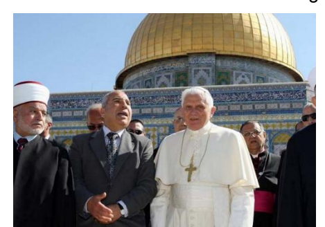
3 The Pope and Islamic leaders with the Dome of the Rock

But why is it so important to the world? First from a religious-political position, it is the focus of over ½ world's religious populations, 3.5 Billion people. The Jews are about 20 million people on the earth, but Christianity is numbered at 2 Billion and Islam is numbered at 1.5 Billion, which is 50% of the earth population. Secondly, from the Biblical perspective, Jerusalem is the city of God's choosing, The Bible declares Jerusalem is the city of God (Isaiah 62:1-6). So if the Bible is true then Jerusalem matters, if the Bible is false then Jerusalem can be forgotten about.