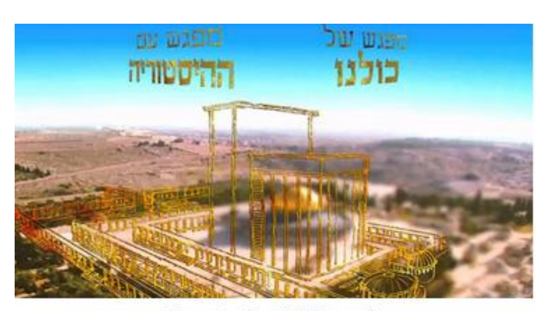
Plans for the Third Temple