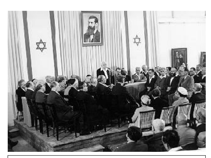
On the day, May 14<sup>th</sup> 1948, the State of Israel was declared