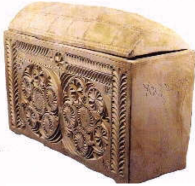
Ossuary of Caiaphas

The New Testament claims to be the written record of Jesus' ministry, his teachings, and the formation of his church. Are we able to validate these claims? The New Testament proclaims itself as truth, meaning its words should correspond with fact. The Gospels and Epistles have very specific names individuals, places, and events. Do these New Testament records correspond with historical facts? If the New Testament is not true historically, why should we rely on its contents for spiritual truth?